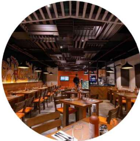
BAR AND RESTO